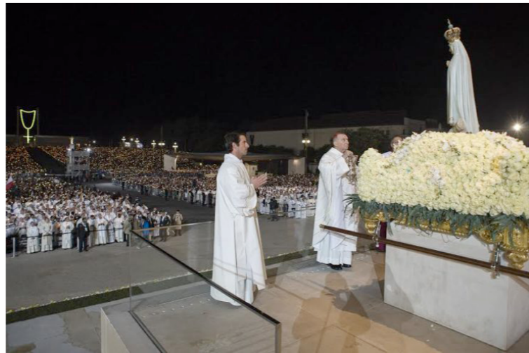
Cardinal Parolin incenses the statue of Our Lady of Fatima surrounded by white roses 12 October