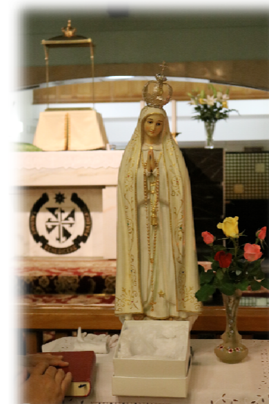
Our Lady with Her new crown