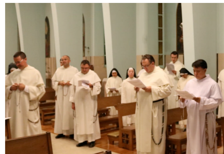
Friars and Nuns pray together the Holy Rosary in the Monastery Chapel 11 October

the loving intercession of St. Francisco and St. Jacinta for our Rosary Promoters. We also wish to express our heartfelt gratitude to those Friars who responded to the call of Our Lady to come to Fatima to meet together in prayer, to speak, to share and to plan for the future of their Rosary mission in their Provinces. Long before they arrived we had kept them all in our prayers, beseeching the graces they would need for their great mission in the Order. There are so many ways to promote the prayer of the Rosary: simple side-walk preaching of the Rosary can be as efficacious as the most eloquent of homilies. To be seen walking with Rosary in hand can be a silent means of promoting the Rosary. The Rosary places the Gospel in our hands. When we pray it devoutly the Gospel takes root in