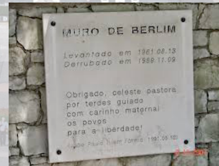
A portion of the Berlin Wall brought to Fatima after it was demolished Nov 9, 1989