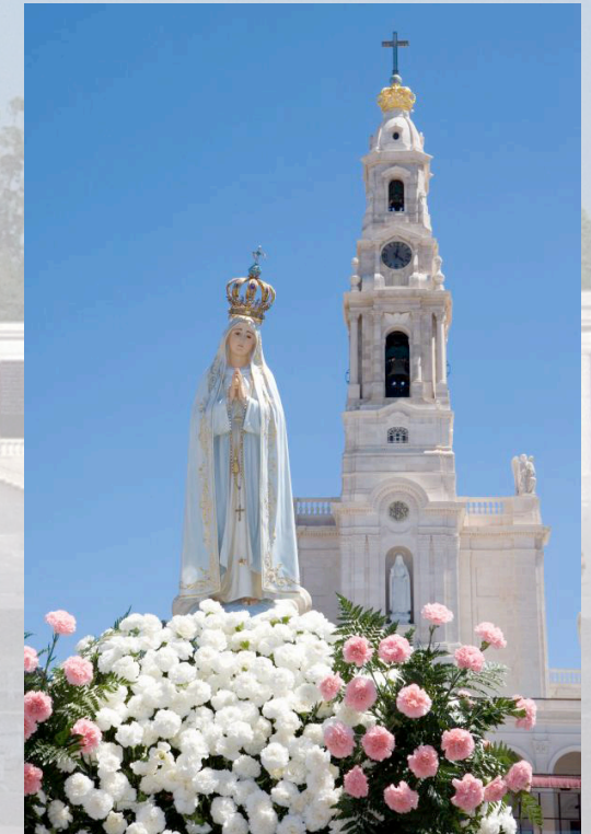
Shrine of Our Lady of the Rosary of Fatima and Our Lady being carried in Procession