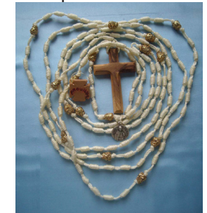
Pilgrim Rosary from Our Nuns in Prouilhe

Pray, Preach, Live the Rosary, the prayer of the Heart of Mary!