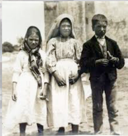
Little Shepherds after July 13, 1917 Apparition