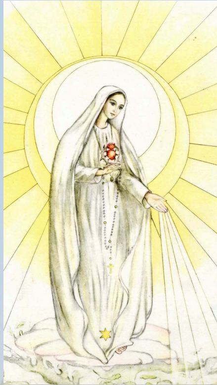
Immaculate Heart of Mary – the “Soul of the Message of Fatima”