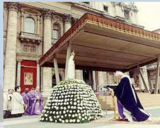
Pope John Paul II consecrates the world and Russia to the Immaculate Heart of Mary - 25 March 1984