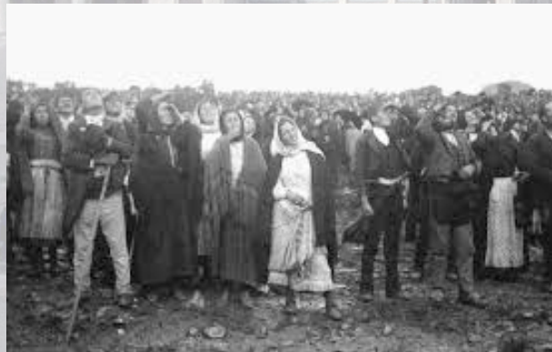
Pilgrims in Fatima 1917