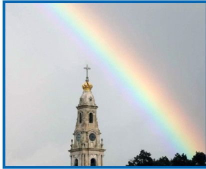
Rainbow over the Basilica of Our Lady of the Rosary in Fatima

Therefore, to counter the “satanic scourge”(a term used by Pope Pius XI) of communism coming forth from the eastern most regions of Europe, Heaven offered the “peaceful and irresistible weapon” of the Immaculate Heart of