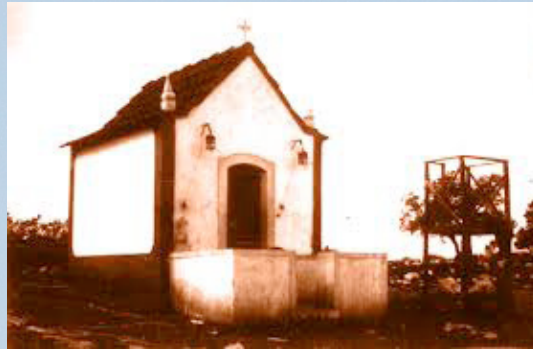
Original Chapel on the Site of the Apparitions