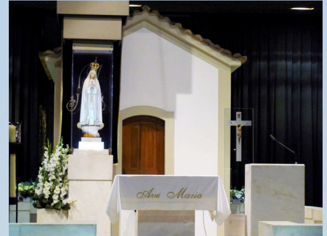
Chapel of Apparitions today