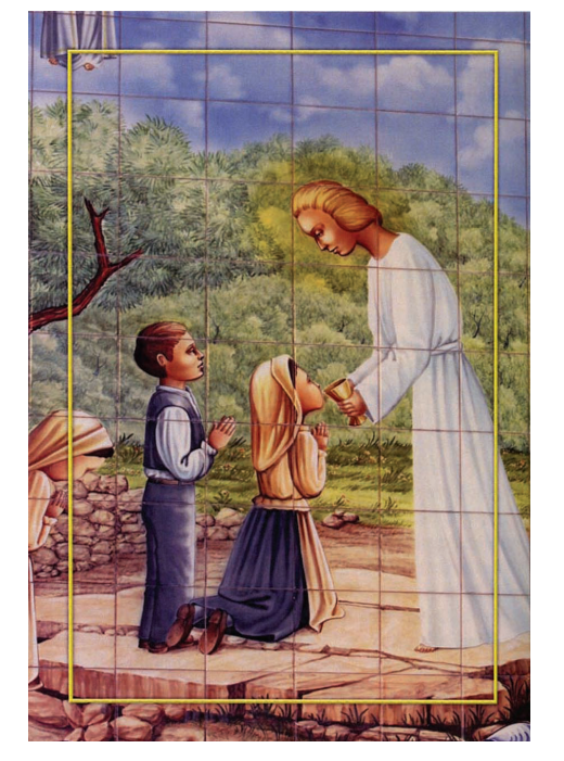
The Angel gives Holy Communion to the Children of Fatima (Cathedral of Karaganda, Kazakhstan)

Centenary of the Apparitions of the 'Angel of Peace' in Fatima 1916 - 2016