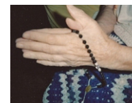
Praying hands of a Great-grandmother

Dear Rosarians, as we begin a New Year of grace we are conscious that the Rosary is needed perhaps as never before. Making the world a better place begins with each one of us. At times it may help to pause and reflect on how or what difference the Rosary is making in my life. How does the Rosary help me to grow as a Christian? Do I find myself more often with my Bible in hand? Is my Communion more fervent? Am I more willing to forgive; more committed to Truth; more detached from earthly goods; more ready to offer a word of hope to others in need; do I view Heaven as my 'true country' the true goal of my earthly journey? Praying the Rosary makes a difference!