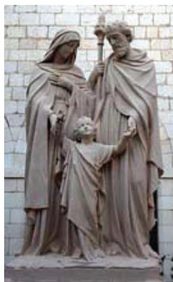
Holy Family statue in Nazareth