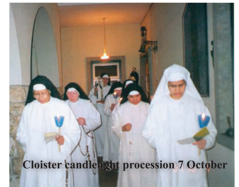
Cloister candlelight procession 7 October

...In this light, nuns relive and perpetuate in the Church the presence and the work of Mary. Welcoming the Word in faith