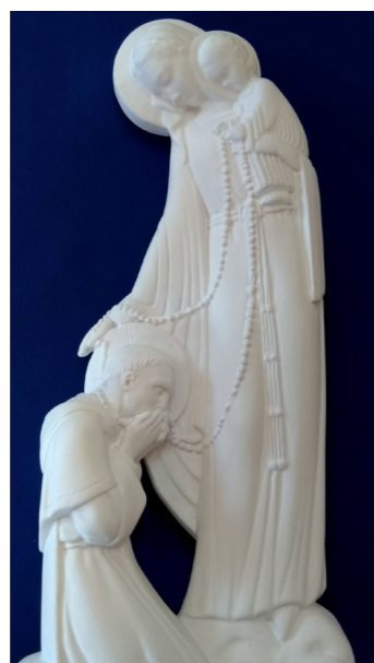
Holy Father St. Dominic, pray for us! Laudare Benedicere Praedicare

Dominic was canonized in 1234 and it is he himself who, with his holiness, points out to us two indispensable means for making apostolic action effective. In the very first place is Marian devotion which he fostered tenderly and left as a precious legacy to his spiritual sons who, in the history of the Church, have had the