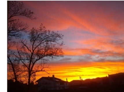
Sunrise over the Monastery in winter In this moment of trial take time to reflect on the beauty of God’s creation

Some have written to ask if our Community is well and what are the effects of the pandemic here. We are very grateful for your concern. We take precautions as everyone else and trust in God. We have had no visitors since the first months of this year just before the various governments began to restrict travel and implement other measures to safeguard the people