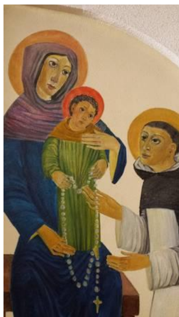
Picture in OP Fathers House in Japan

Our Lord is saying that in every mystery you will find My Love! The Rosary is a prayer of love and the more we pray this prayer the more our hearts grow in love. Praying the Rosary we place ourselves in the Heart of Jesus and the Heart of Mary. We pray in Their Love and this gradually transforms our hearts to become more loving, more kind, more merciful, in a word, to see all things, all circumstances and all persons in the light of Their love. This indeed is what happened in the lives of the Little Shepherds of Fatima and can happen for us too.