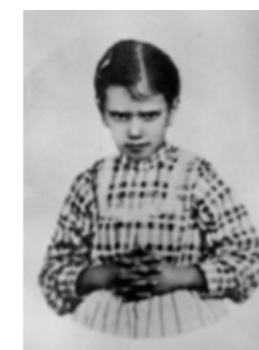
Jacinta shortly before her death

In other words, I need you to be missionaries! St Jacinta, open to the Divine Light that penetrated her heart and soul, became a great missionary. One might ask: How can this be when Jacinta never left her own