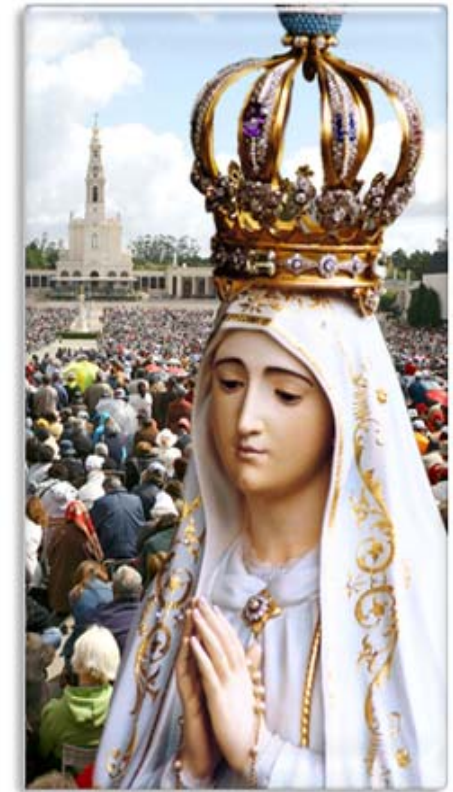
Our Lady of the Rosary of Fatima, pray for us!